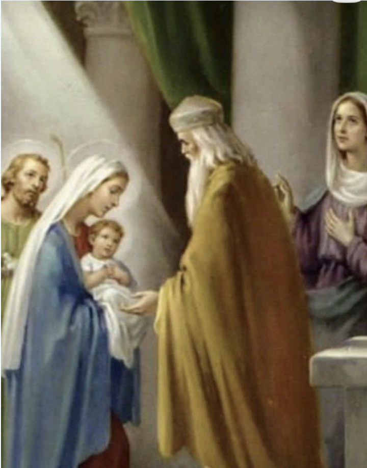
Queen of Heaven Day Twenty - three

...Forty days from the birth of little King Jesus are about to sound when the Divine Fiat calls us to the Temple in order to fulfill the law of the Presentation of my Son. So we went to the Temple. It was the first time that we went out together with my sweet Baby.