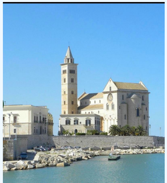
Cathedral of the Archdiocese of Trani