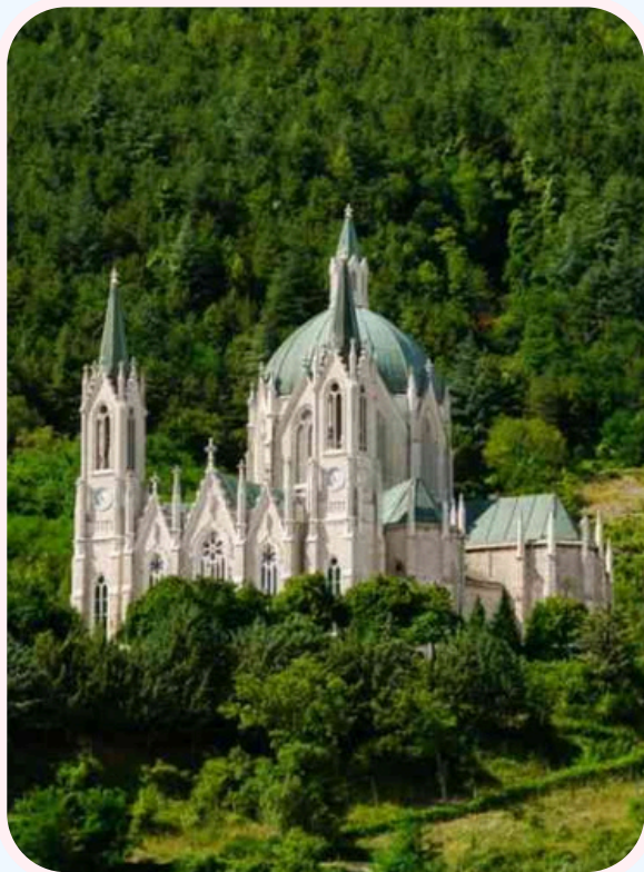
Sanctuary of Our Lady of Sorrows